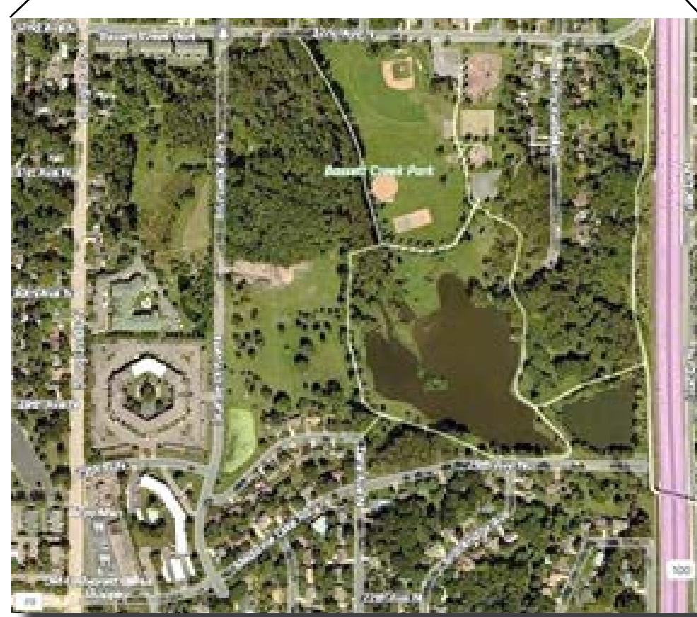
Basset Creek Park