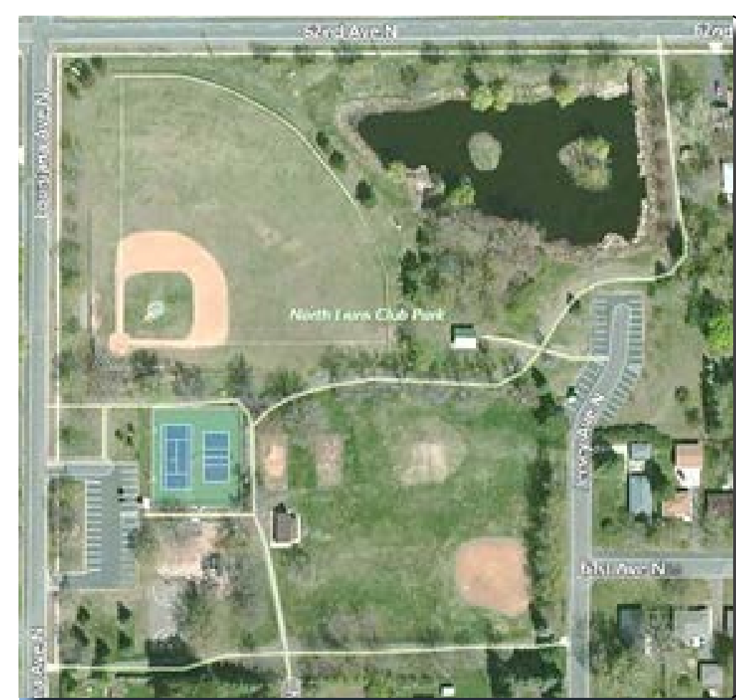
North Lion's Park

In addition, a master plan for Becker Park will be created, which is located in the city's main commercial area. Conceptual park plans will also be created for 3 of the City's community parks, including: North Lions Park, Welcome Park and Basset Creek Park.